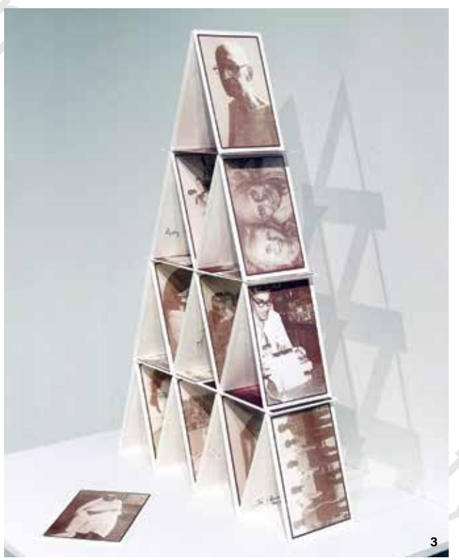
1 Self Reflection, 3 ft. 5 in. (1.2 m) in length, wheel-thrown and altered stoneware, 2012. 2 "My Plans for the Future" excerpted from All About Me, written by Heidi McKenzie, May 31, 1978. 3 House of Cards, 24 in. (61 cm) in height, porcelain substrate, iron-oxide ceramic decals, archival tape, graphite pencil, 2019.