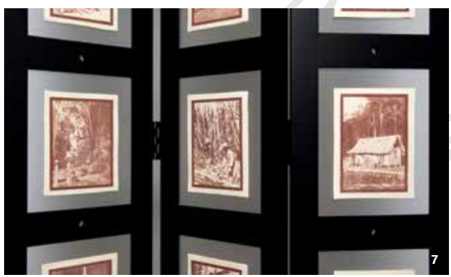
4 Building Blocks, 23 pieces, installation variable, slab-built stoneware, ironoxide decals, 2020. Photo: Ali Kazimi. 5 Postmarked (installation view at the Gardiner Museum, Toronto), 6 in. (15 cm) in height each, 21 slip-cast porcelain tetrahedrons, iron-oxide ceramic decals, 2017. Photo: Josie Slaughter. 6 Illuminated (detail, 3 of 15 lanterns), to 10 in. (25 cm) in height, hand-pressed low-fire porcelain tiles, iron-oxide ceramic decals, wood, metal, LED fixture, 2020. Photo: Dale Roddick. 7, 8 Division (detail and overall), 5 ft. 4 in. (1.7 m) in height, hand-pressed low-fire porcelain tiles, Plexiglas, acrylic tape, wood, metal hinges, 2020. Photo: Dale Roddick.

punctuation and sentence variety; there are no spelling or grammatical errors. Not only does the content tell of a desire for a future in ceramics, but the presentation also suggests a future that includes writing. McKenzie has been a frequent contributor to this and other ceramic publications, in addition to creating curatorial projects. But while the teaching portion of the prognostication has not eventuated, McKenzie is indeed educating: bringing recognition to class, race, migration, and colonialization, both in the past and today.